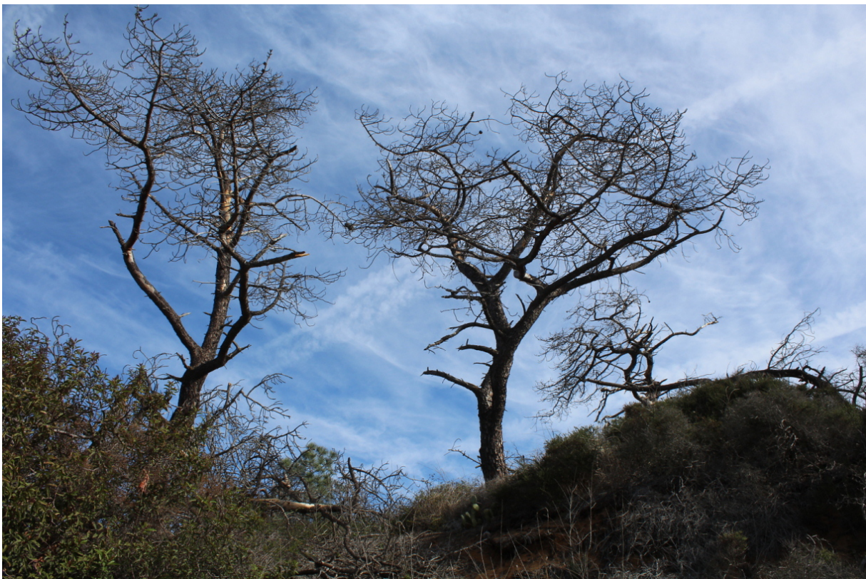
Figure 3. From [20]. Dead Torrey Pines silhouetted against a sky corrupted by jet-emplaced particulate trails.

Observant individuals will have no trouble seeing white trails across the sky, like those shown in Figure 3, that have increased in frequency, intensity, and geographic range over the last three decades, especially during the Obama Administration. These are not harmless ice-crystal contrails that quickly disappear by evaporation, as the public is being deceived [17-19]. No. These trails are made of fine particles that quickly spread out to become a white haze before falling to ground in a matter of days, along the way mixing with the air we breathe.