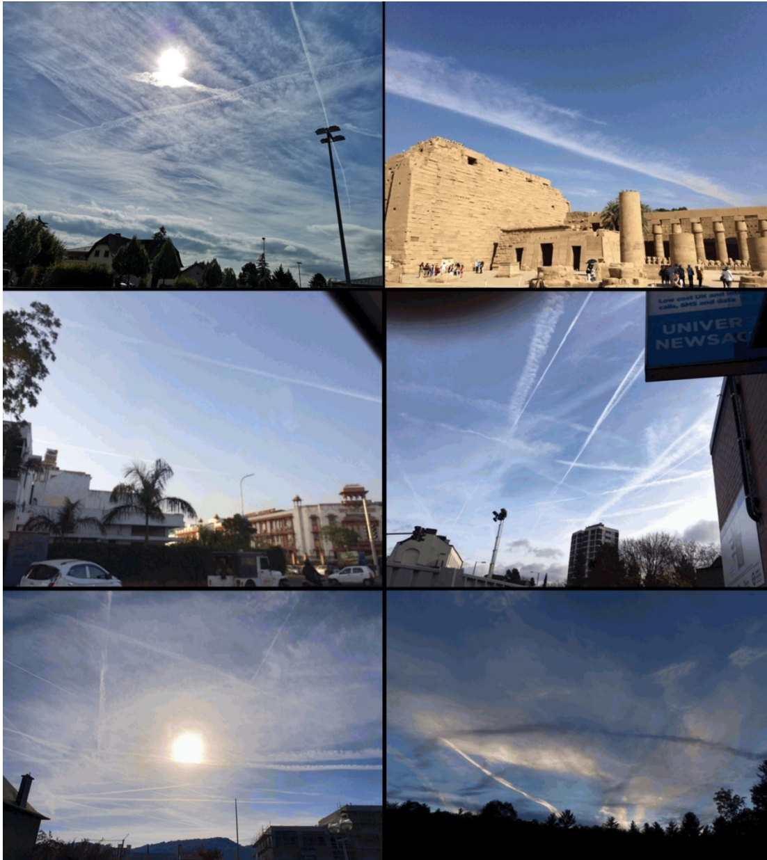
Figure 5. Deliberate jet-emplaced particulate trails, clockwise from top left Geneva, Switzerland; Karnack, Egypt; London, England; Danby, Vermont, USA; Luxemborg; Jaipur, India. The image at lower right shows the addition of carbon black trails, which are more efficient for atmospheric heating than coal fly ash.

Clearly, there is more than simply U.S. military involvement. On October 5, 1978, the United Nations under the category of disarmament entered into force a Trojan horse international treaty, "Convention on the Prohibition of Military or Any Other Hostile Use of Environmental Modification Techniques" [65]. Precise legal analysis shows this treaty to be a sham [31]. Instead of its titular prohibition, said treaty mandates environmental modification for " peaceful purposes " where environmental modification is defined as