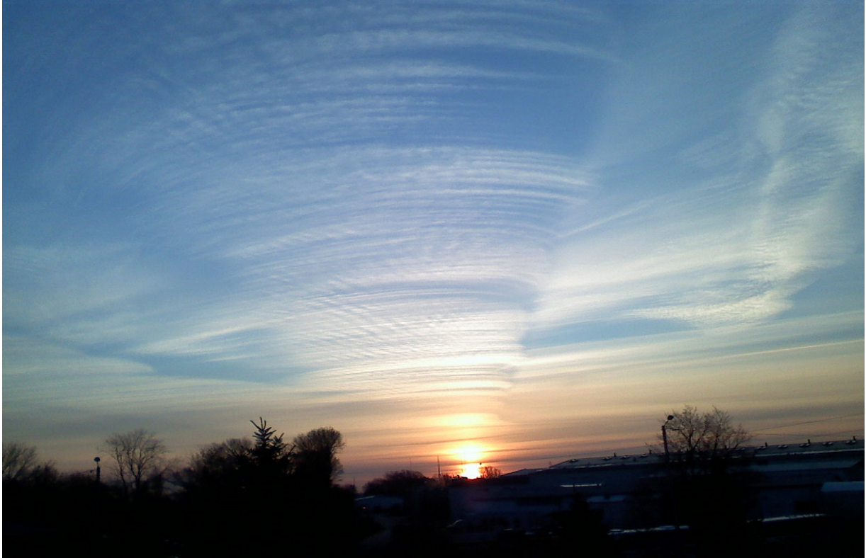
Figure 4. Example of electromagnetic radiation being used for weather manipulation. From [63].