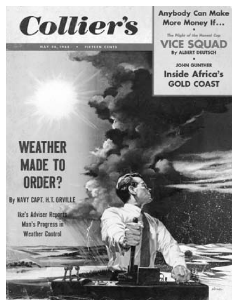
Experiments with cloud seeding during the Cold War inspired fantastic predictions about America's ability to control the weather and use it as an aid to farmers and a weapon against communist adversaries.

presented a seminar at GE titled "Pathological Science," or "the science of things that aren't so." Yet there is hardly any scientific foundation for most claims about weather modification. Cloud seeding apparently can augment "orographic" precipitation (which falls on the windward side of mountains) by up to 10 percent. It is also possible to clear cold fogs and suppress frost with heaters in very small areas. That is the extent of what has been proved. Nevertheless, millions are still spent on cloud seeding today, largely by local water and power companies.