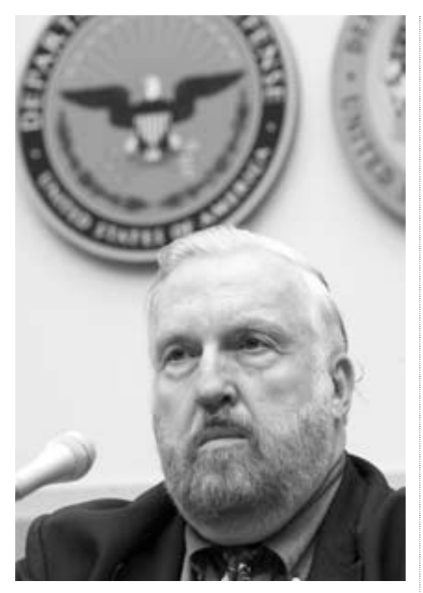
Physicist Lowell Wood wants to create a "global thermostat."