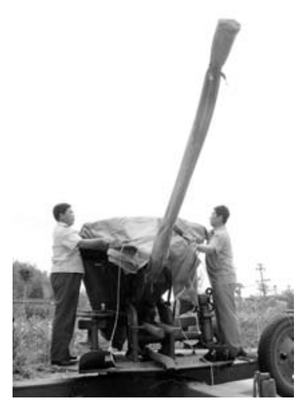
In China's active cloud seeding efforts, anti-aircraft guns are used to shoot silver iodide crystals into the atmosphere. Beijing promises an intensive effort to clear the skies when the city hosts the Olympics in 2008.

In September 2001, the U.S. Climate Change Technology Program quietly held an invitational conference, "Response Options to Rapid or Severe Climate Change." Sponsored by a White House that was officially skeptical about global warming, the meeting gave new status to the control fantasies of the climate engineers. According to one participant, "If