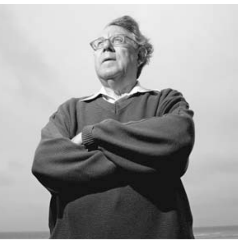
Nobel laureate Paul J. Crutzen favors a planetary "shade."

As the sole historian at the NASA conference, I may have been alone in my appreciation of the irony that we were meeting on the site of an old U.S. Navy airfield literally in the shadow of the huge hangar that once housed the ill-starred Navy dirigible U.S.S. Macon . The 785-foot-long Macon , a technological wonder of its time, capable of cruising at 87