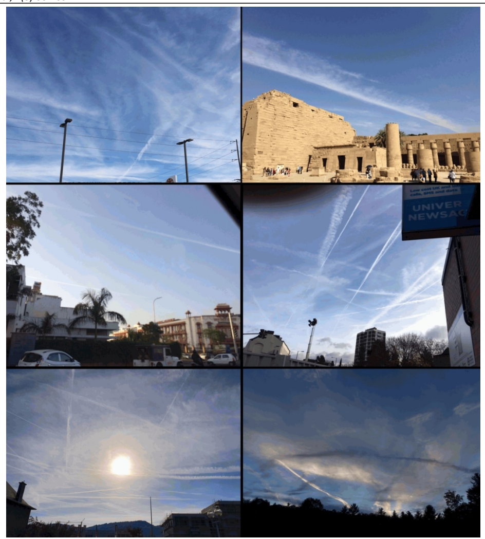
Figure 1. From [25]. Deliberate jet-emplaced particulate trails, clockwise from top left: San Diego, California, USA; Karnack, Egypt; London, England; Danby, Vermont, USA; Luxembourg; Jaipur, India.

The 2005 U. S. Air Force Document AFD-0561013-001 lied about the aerial spraying and set forth the "contrail" basis for public deception [10]. A section of that document entitled The Chemtrail Hoax states in part: