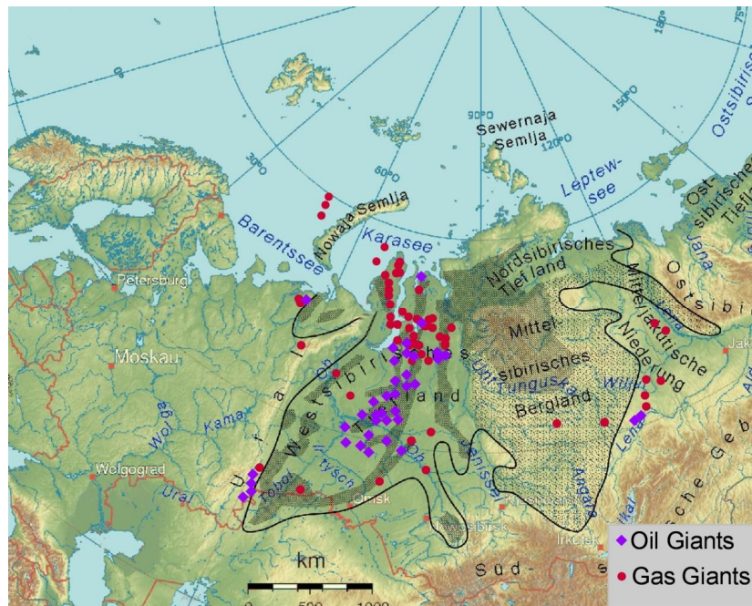
Fig. 4. The relationship between major petroleum and natural gas production wells and the boundary of the Siberian Traps, indicated by the black line. Methane hydrate deposits currently locked in the permafrost within this extensive area upon melting pose a major catastrophe. From [85]

The rifting that occurred east of the Urals 250 million years ago resulted in one of the world's largest petroleum and gas deposits, as shown in Fig. 4 [85]. There is considerable frozen methane trapped in the permafrost in that extensive northern area [86]. Anthropogenic global warming, caused by the near-daily, near-global aerial particulate spraying, poses a serious risk of massively thawing and releasing that entrapped methane to the atmosphere. The potential for another mass-extinction event, should this happen, cannot be dismissed.