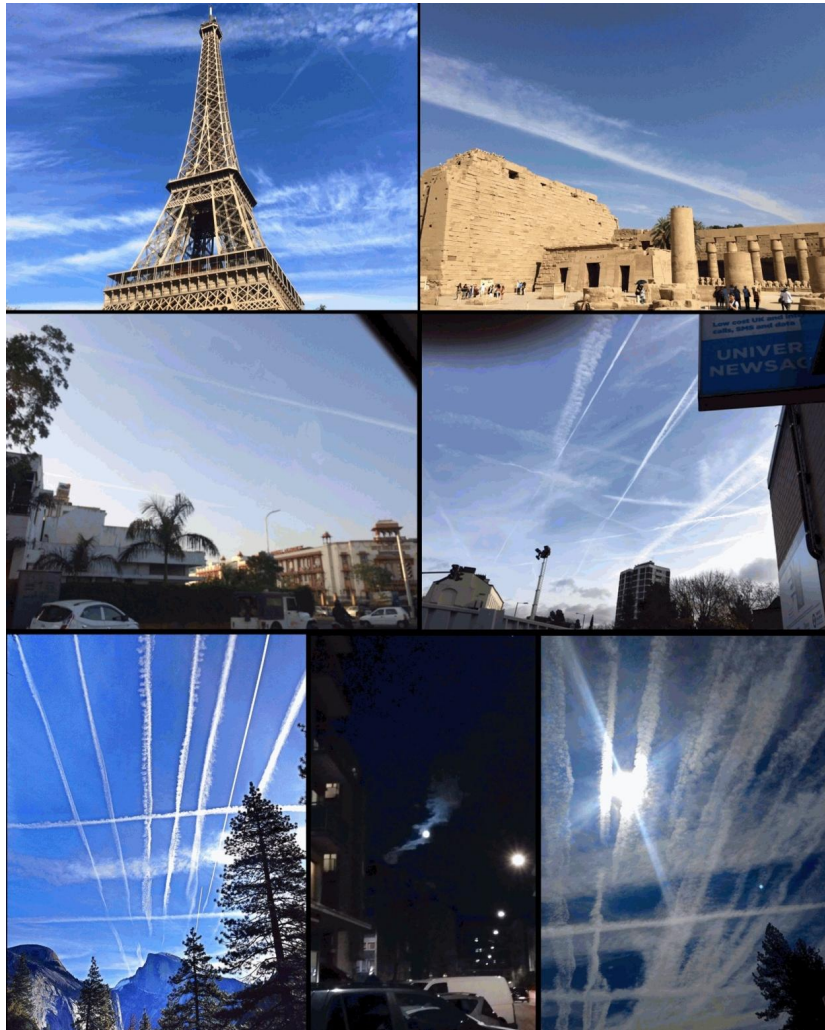
Fig. 1. Climate manipulation particulate trails. (Photographers with permission) Clockwise from upper left: Paris, France (Patrick Roddie); Karnak, Egypt (author JMH); London, England (author IB); Northern California, USA (Patrick Roddie); Geneva, Switzerland (Beatrice Wright); Yosemite, California USA (Patrick Roddie); Jaipur, India (author JMH)

geoscience community who now discuss the possibility of placing material in the upper atmosphere to reflect a portion of sunlight back into space, 'sunshades for the Earth'. As we discuss below, particles placed in the atmosphere exhibit behavior in response to incident radiation that is considerably more complex than described by MacDonald, as are their physical and chemical reactions in the atmosphere and at the Earth's surface.