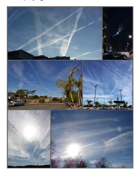
Fig. 1. Images of tropospheric particulate trails in the sky. Top: Geneva Switzerland, courtesy of B. Wright; Middle: Left, Chula Vista, California (USA), courtesy of R. Beas; Right, San Diego, California (USA), courtesy of J. M. Herndon; Bottom: Sacramento, California (USA) showing white particulate haze, courtesy of D. Whitman

submicron pollution particles into the region where clouds form to interfere with moisture droplets coalescing to become sufficiently massive to form rain drops. Since the late 1990s, numerous witnesses have observed particulate trails sprayed by jet-aircraft across the sky. Soon after being released, the trails start to spread out, sometimes briefly appearing similar to cirrus clouds before further spreading to leave a white haze in the sky (Fig. 1). There has been a deliberate effort to deceive the public into believing that the particulate trails are jet contrails made of ice crystals [6]. But contrails only form at low temperatures and high humidity provided there is sufficient water vapor in the aircraft exhaust [15]. Contrails rapidly disappear by evaporation (sublimation) into invisible gaseous water. Contrails do not routinely leave a persistent white haze in the sky as does particulate spraying, which in instances of heavy aerial spraying takes on a brownish hue.