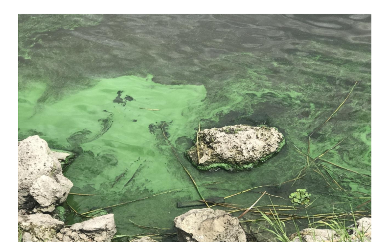
Fig. 6. Blue-green (cyanobacteria) bloom – Eastern shore of Lake Okeechobee near Pahokee, Florida. May 17, 2019

High nutrient loading, rising temperatures, enhanced stratification, increased residence time, and increased salinity all favor cvanobacterial dominance in many of these aquatic ecosystems [62]. Cyanobacteria resist pollution and are even used in so-called "photoremediation," or bioleaching of heavy metals from coal fly ash [63]. Cyano-HABs have serious adverse effects on human and environmental health that are projected to expand and worsen with demographic and climate changes [64] and increased aerial particulate pollution.