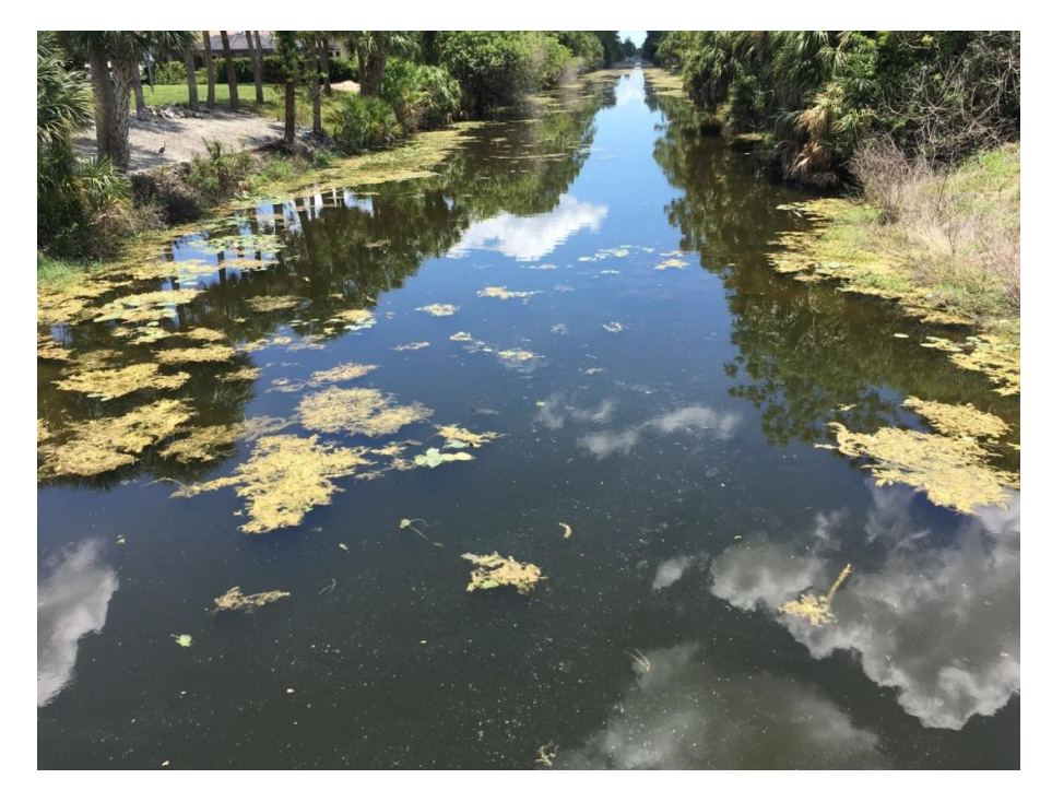
Fig. 5. Blue-green algae along shore of residential canal – Port Charlotte, Southwest Florida. May 20, 2019

Cyanobacteria are often called "blue-green algae," but they are actually photosynthetic prokaryotes with no direct relationship to higher algae (Figs. 5 and 6). Throughout their long evolutionary history, cyanobacteria have diversified into a great many species with various morphologies and niche habitats. They occur as unicellular, surface attached, filamentous, colonial, and mat-forming species, and they inhabit diverse freshwater and marine systems across a wide range of eutrophic and oligotrophic conditions [61].