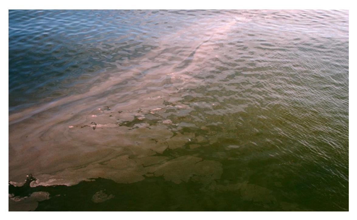
Fig. 1. Karenia brevis and Trichodesmium erythraeum Bloom, Offshore Lee County, Florida (USA), October 22, 2007.

Whiteside and Herndon; AJOB, 8(2): 1-24, 2019; Article no.AJOB.49509