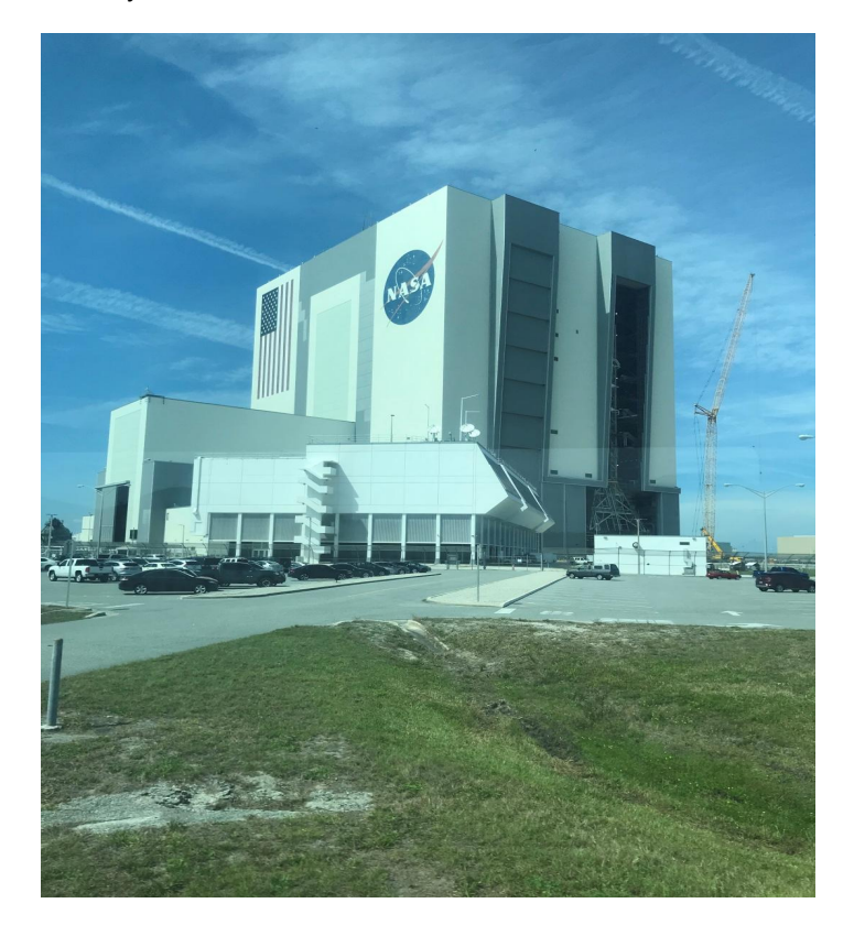
Fig. 4. Exterior view of NASA's Launch Control Center at Kennedy Space Center, Cape Canaveral, Merritt Island, Florida against a sky filled with jet-emplaced particulate geoengineering trails

In a time span of a few minutes to hours the trails spread out, for a time resembling cirrus clouds, before further spreading-out to become a white haze in the sky [27]. The fine-grained particles mix with and contaminate the air we breathe and settle to earth, slowly poisoning the soil and bodies of water [28].